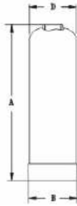
6" - 16" Standard Base