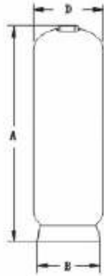
18" - 36" Standard Base